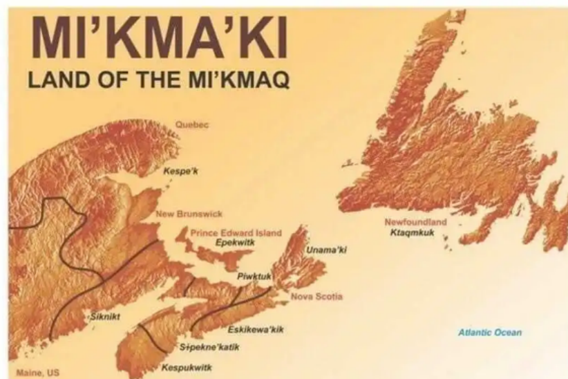
FIG. 1.1 / MI'KMA'KI TANTU'U-KINANGENIK. TEACHING ABOUT THE MI'KMAQ

We cannot celebrate the accomplishments of our last year without noting the ways we know we have more work to do. Serving our Indigenous and Black communities is an area that we are working to further prioritize through our programming, representation within our staff and volunteer positions, and in our educational content. We take full responsibility for our continued growth in this area, and are excited for a year full of deeper, wider, and more diverse programs and services.